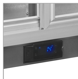
Protective thermostat cover